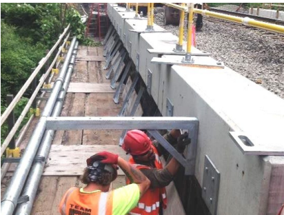
Construction at Willow Brook Bridge in Berlin