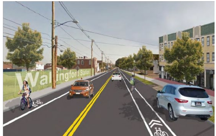
Proposed improvements to North Colony Street include on-street bicycle lanes, dedicated on-street parking, and a wider landscaping buffer on the east side of the street for greater pedestrian safety and ambience.

The plan recommends replacing the existing commercial, industrial zone near the station with medium- and high-density residential zoning while moving the heavier commercial and industrial uses towards North Plains Highway. The plan also supports improvements in the station area that will encourage new residential and commercial development and better connect the station to downtown Wallingford.