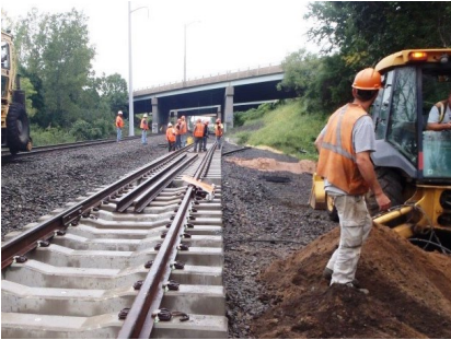
New Track Construction in North Haven