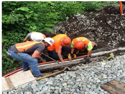
Communications crew removing split steel in Berlin