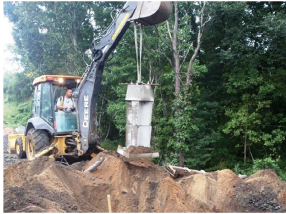
Setting the Signal Foundation In North Haven

To keep the public informed of construction progress, construction photos are posted weekly. Visit the photo gallery section of the website at www.nhhsrail.com/gallery .