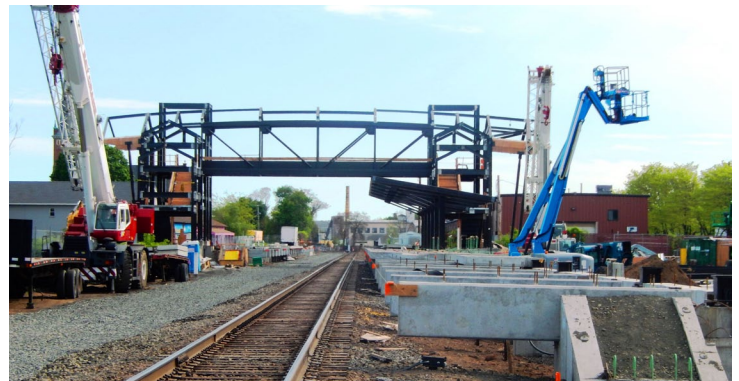
Overhead pedestrian bridge at the new Wallingford Station.

Hartford Union Station underwent improvements as a newly installed high-level platform went into service the first week of August. Unique to Union Station is the incorporation of a fold-up edge along the platform. While normally in the level or “down” position for passenger use, this feature allows the edge