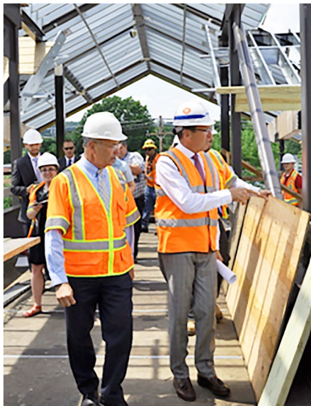
CTDOT Commissioner James P. Redeker and Governor Dannel P. Malloy view construction progress at the future Wallingford Station.

Construction at stations generally includes the installation of high-level platforms (approximately 500 feet), an overhead pedestrian bridge, passenger information display systems, ticket vending machines, automatic snowmelt systems and one electronic vehicle charging station. All station elements will be Americans with Disabilities Act (ADA)-compliant. Other planned improvements include increased parking, bicycle racks, video surveillance systems and emergency telephones.