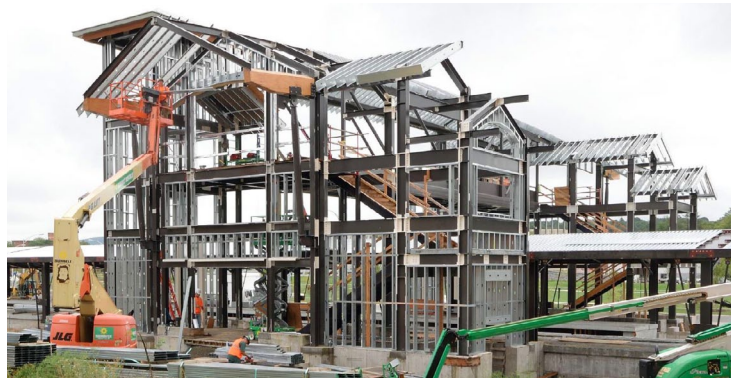
Construction of the new Meriden Station.