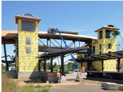
Construction of the overhead pedestrian bridge at the new Wallingford Station