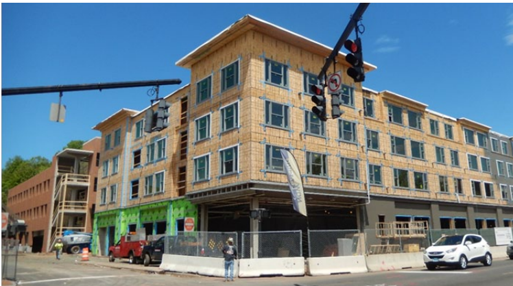
This Transit-Oriented Development (TOD) project in Meriden, across the street from the train station, will provide a combination of 63 affordable and market rate apartments, 11,000 square feet of ground floor retail space and a 275-space parking garage for use by residents, customers, and rail passengers.