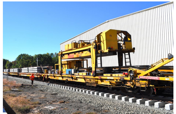
At about 150 feet in length and weighing over 200 tons, the TCM is one massive machine!

As part of the NHHS Rail Program, the 250-ton TCM constructed nearly nine miles of track between North Haven and Meriden. The effort took approximately three weeks to complete and safely and efficiently constructed new track without interfering with existing train traffic on the adjacent existing mainline track. The primary benefits of using a TCM over other methods of track construction are its production capability and the fact that it can lay track without disrupting train operations on adjacent tracks. This marks the first time a TCM was used to lay this significant length of track in Connecticut.