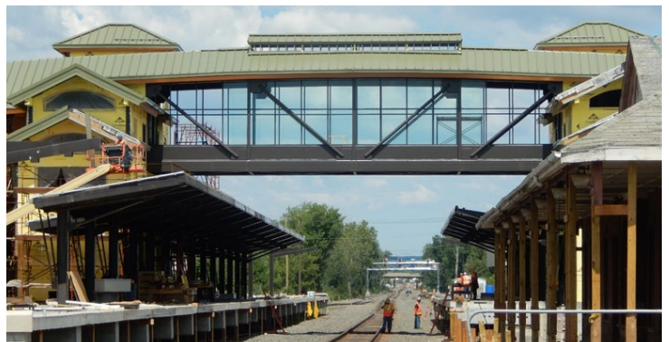
Overhead pedestrian bridges, such as this one at Berlin Station, will enable passengers to safely access both platforms.